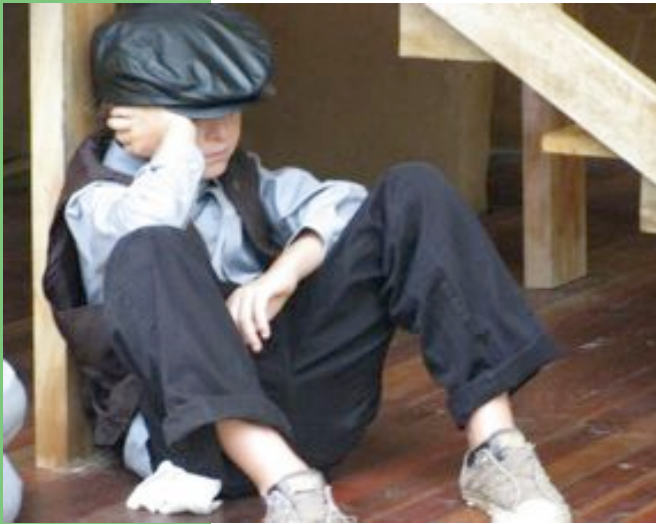
Above: A Fagin Boy, asleep